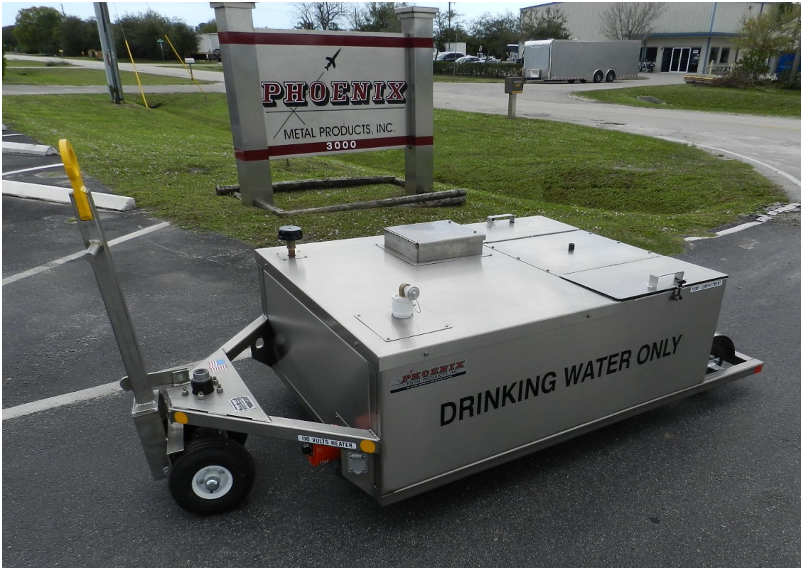
PNX-WCH100 LP Low Profile Potable Water Cart